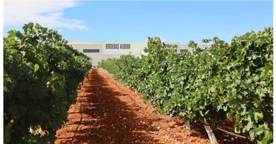
CASAS DE GUIJARRO (CUENCA, SPAIN)