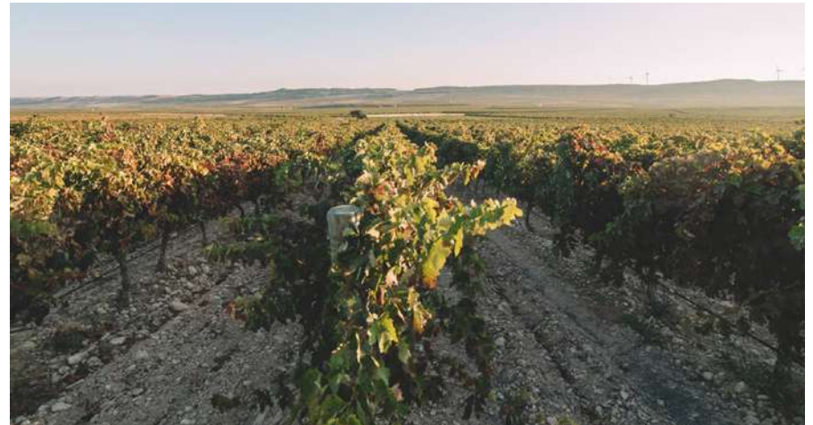
VALLADOLID & NAVARRA (SPAIN)

These wines feel like a trip to different countries and winegrowing regions, a discovery of unique winemaking methods and diverse vineyards. They produce wine in multiple regions across Spain and France: Yecla, Bierzo, Bajo Aragón, Côtes de Gasconne and Pays D'Oc.