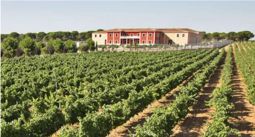
LAS PEDROÑERAS (CUENCA, SPAIN)