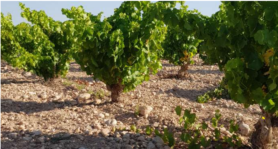
SPAIN & FRANCE

Family-owned winery, focused on indigenous grapes from their undiscovered region. As one of the very few wineries located in the Ribera del Júcar D.O., they have made it their mission to bring the unique wines from this region to the international spotlight.